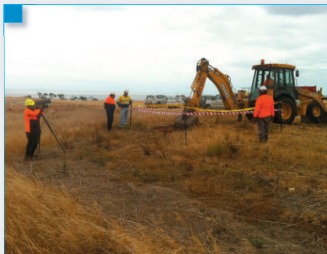
Filming of the Training Video at Hillside.

Rex works closely with Narungga regarding heritage management at Hillside.