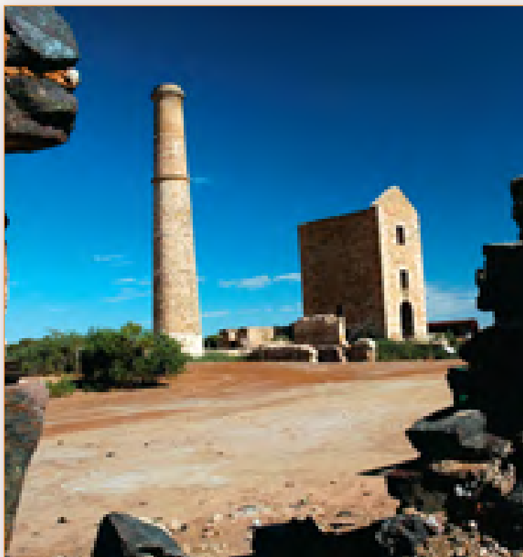
Old Cornish Wheal (Mine) – Engine House and Stack Moonta, Yorke Peninsula, South Australia