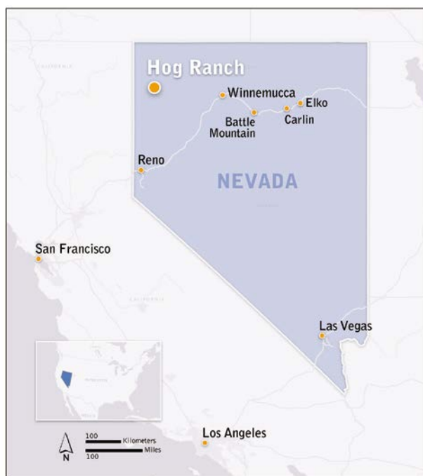
Figure 1: Regional location diagram of the Hog Ranch Property, Nevada USA.

Rex has currently identified two main projects areas, the Krista Project (Krista) to the north and the Bells Project (Bells) to the south (See Figure 2). Historically, ore was mined from five pits to the north (in the Krista Project area) and 1 pit to the south (the Bells Project area) for a total of six pits.