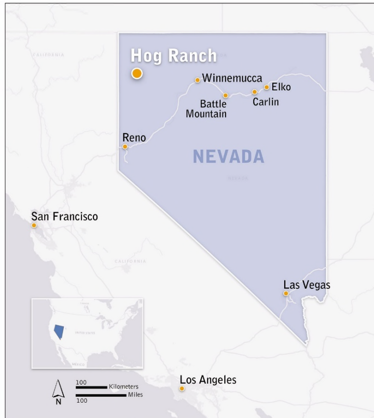
Figure 3: Regional location diagram of the Hog Ranch Gold Property, Nevada, USA

For more information about the Company and its projects, please visit our website ' www.rexminerals.com.au ' or contact: