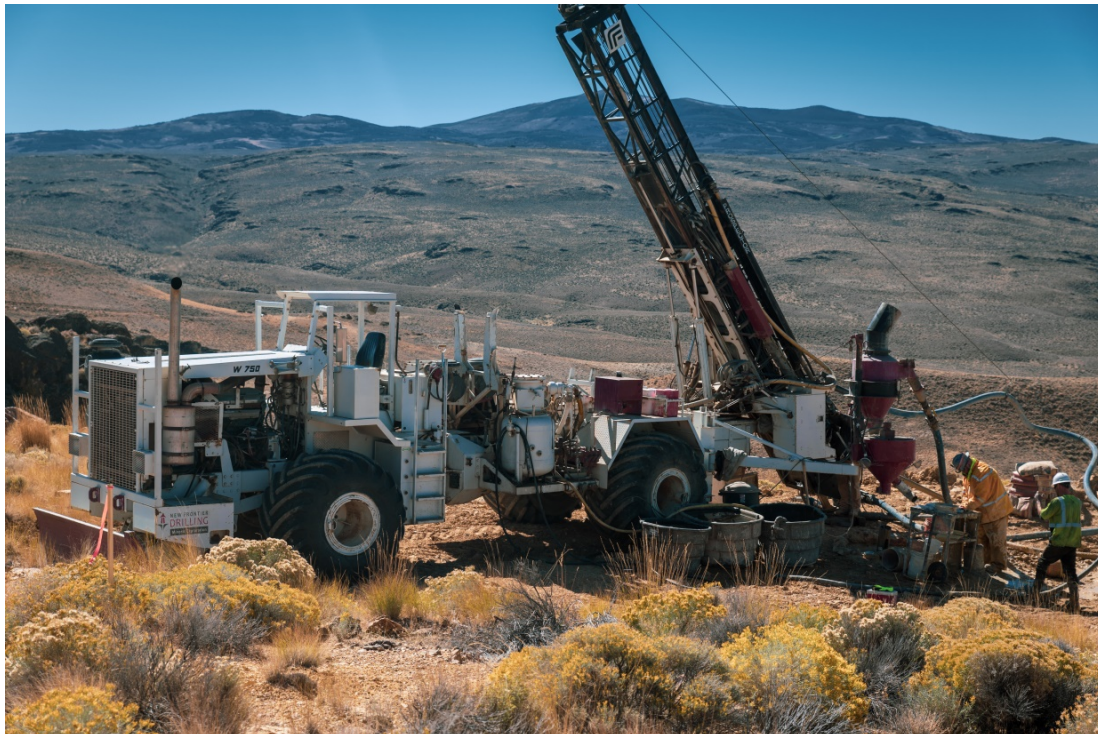
Figure 2: RC drill rig on the first hole at the Bells Area – Hog Ranch Gold Property